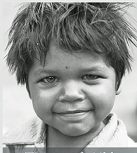
The eternal child.