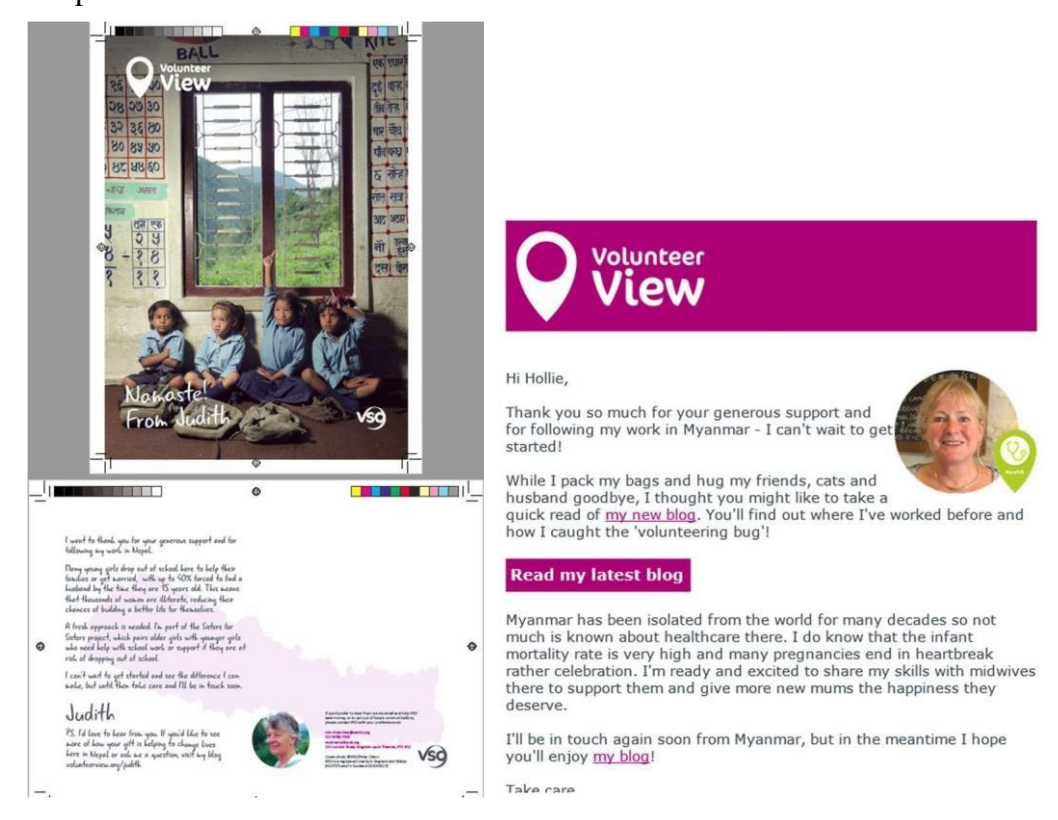
Examples of Email 1 and Postal 1

The second thing our regular givers receive is an email or postcard timed to arrive one day before their first gift is taken. Both are personalised and written from their chosen volunteer. Generally, the content talks about the volunteer's preparations and expectations before travelling out to their placements: what they will miss most, what they are most excited about etc. We also encourage donors to click or visit their volunteer's blog, where they can read more and see pictures.